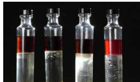
Brand E Brand F Brand G CenPeCo