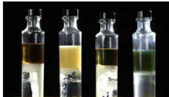
Brand A Brand B Brand C Brand D

Water contamination is a fact of life in heavy-duty equipment. That's why you need a fluid that stays stable when it comes into contact with water. Fluids that fall apart or experience additive dropout in the face of water contamination can yield insoluble materials that block filters and inhibit oil flow. Cen-Pe-Co Multi-Purpose Hydraulic & Wet Brake Oil is designed to resist interaction with water, protecting against hydraulic system failure and keeping tractors running, reliably.